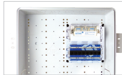
Installs quickly and easily in Primex Verge MDE's