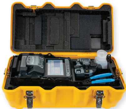
Workstation in Transit Case

Backed by the best service team in the industry, the Fujikura 41S is the ideal splicer to use when portability, ruggedness, and reliability are needed for your splicing application.