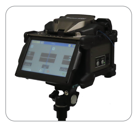
45S on Tripod

The 45S cladding alignment fusion splicer is changing the way people splice fiber in small to mid-fiber count applications. This Fujikura splicer debuts a landmark improvement to the fusion splicing process with the ability to prepare and load both fibers simultaneously. The hand-held fiber coating stripper, the SS-05, is capable of stripping two 250 µm coated fibers in the same pass, along with the CT-16A cleaver adapter plate which can likewise accommodate two bare fibers for cleaving. After preparation, the 45S patented sheath clamps enable loading both fibers simultaneously into the splicer with one fiber in each hand. The user can press down on the sheath clamp base to close it while positioning the fiber in the v-grooves. This enables one-handed operation.