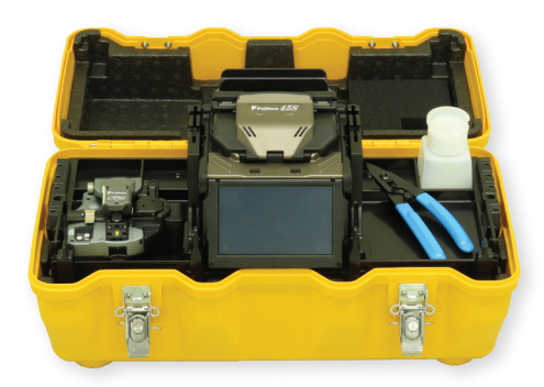
45S Standard Kit