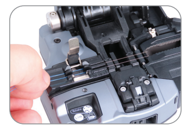
CT-16A Adapter Plate on CT-50