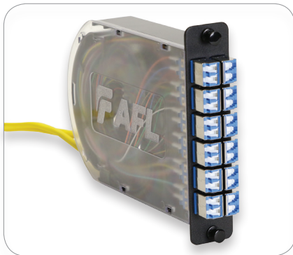
24-Fiber LC/UPC Configuration